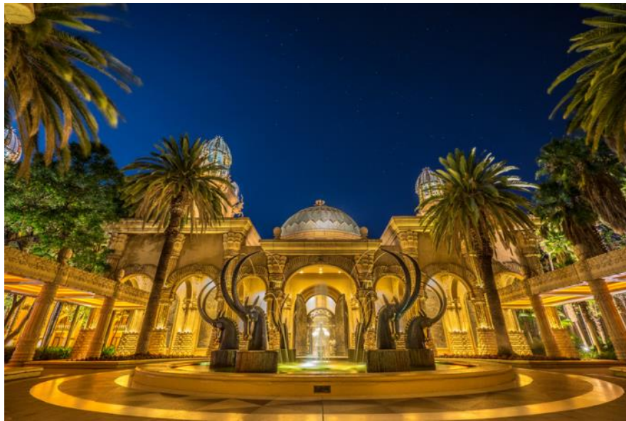
Sun City, South Africa