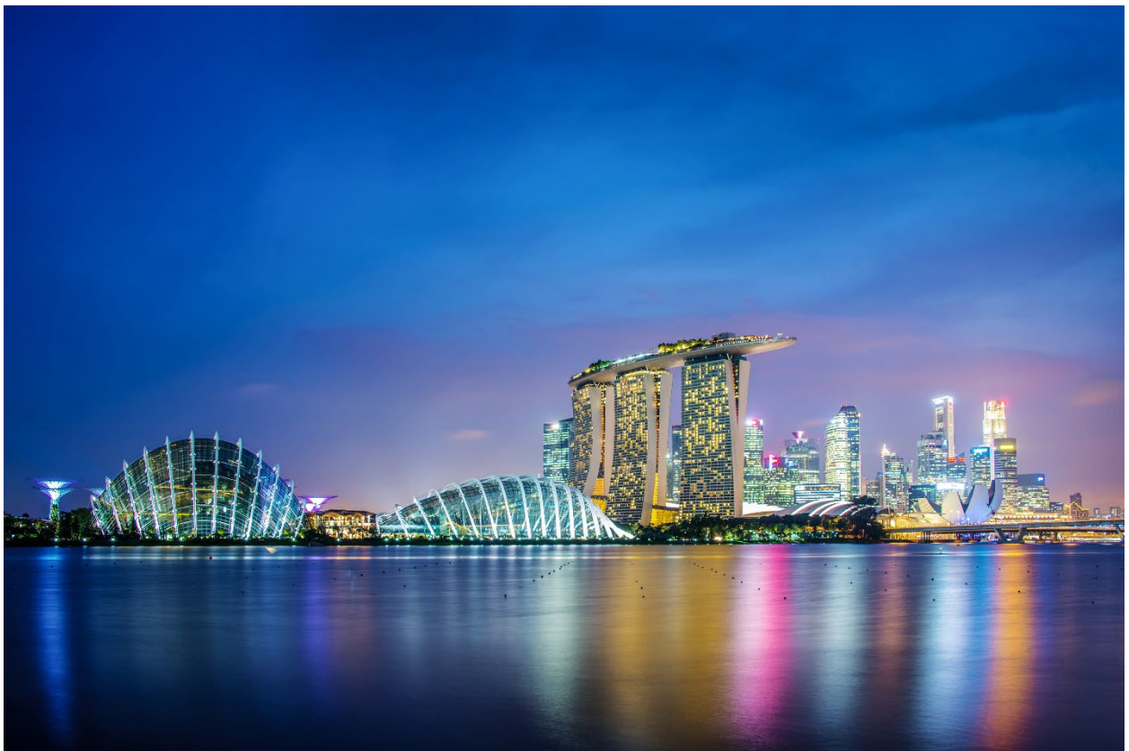
Marina Bay, Singapore