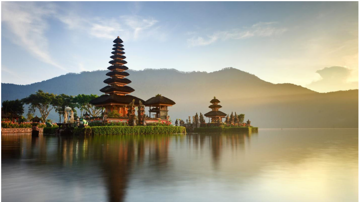
Pura Ulun Danu Bratan, Bedugul, Bali, Indonesia