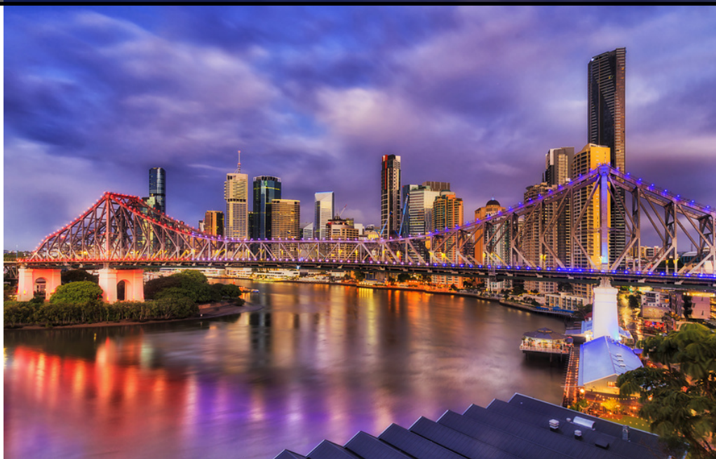
The Story Bridge in Brisbane, QLD - Australia.

New Dates: Under Consideration (The details will be announced in March)