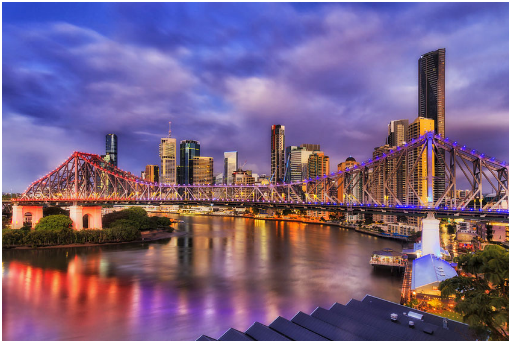
The Story Bridge in Brisbane, Queensland, Australia