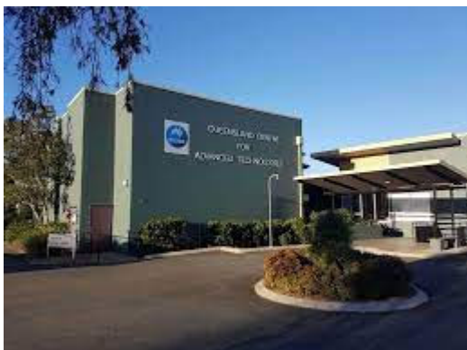
Queensland Centre for Advanced Technologies

QCAT is a world class research and development precinct recognised for the excellence of its contribution to the mining, energy and manufacturing industries. Our mission is to generate products and processes of high value to Australia’s mineral, energy resources, and manufacturing industries with particular focus on those resources and industries located in Queensland. Today, QCAT is home to over 400 researchers.