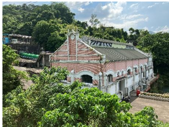
Panoramic view of Xiaocukeng Power Plant

In 2010 it was declared a municipal historic site by the New Taipei City Government.