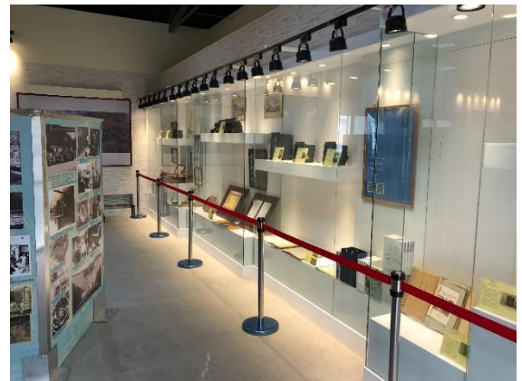
View of the Xindian River Basin Hydropower Heritage Museum