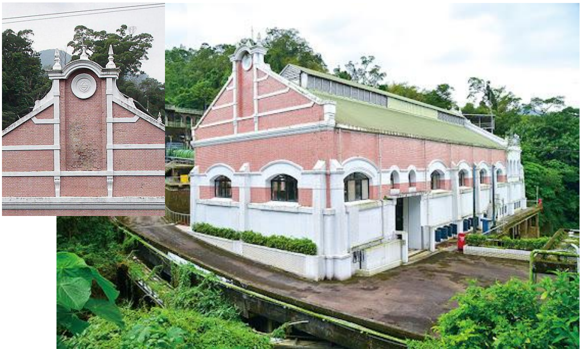
Panoramic view of the Xiaochukeng Power Plant

The Xiaochukeng Hydroelectric Power Plant, completed in 1909, is the oldest existing hydroelectric power plant in Taiwan . Although the turbines were updated in 1991, the original three waterwheel generators have been preserved as part of the cultural heritage, witnessing the history of electricity development in Taiwan.