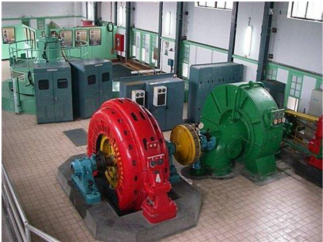
View of the Generators and water turbine

The architecture of the Xiaochukeng Power Plant is constructed of red bricks and features a large-span steel truss structure. The roof is equipped with high skylights to aid in ventilation and heat dissipation. The building's facade is adorned with rounded arches, and the entrance gable retains the "Tai" emblem from the former Governor-General's Office , showcasing the architectural style of the Japanese colonial period.