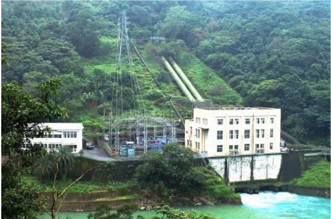
View of the Gueishan Power Plant

Built in 1941 during the Japanese colonial period, the Gueishan Power Plant was originally known as the New Guishan Power Plant. After the Nationalist government took over Taiwan, it was renamed the Gueishan Power Plant. Today, it serves as the administrative center for five power plants under its jurisdiction and has been designated as a historical building by the New Taipei City Government.