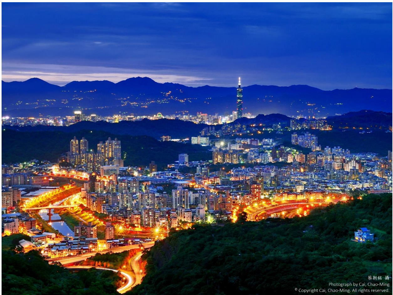
Downtown Taipei, Taiwan