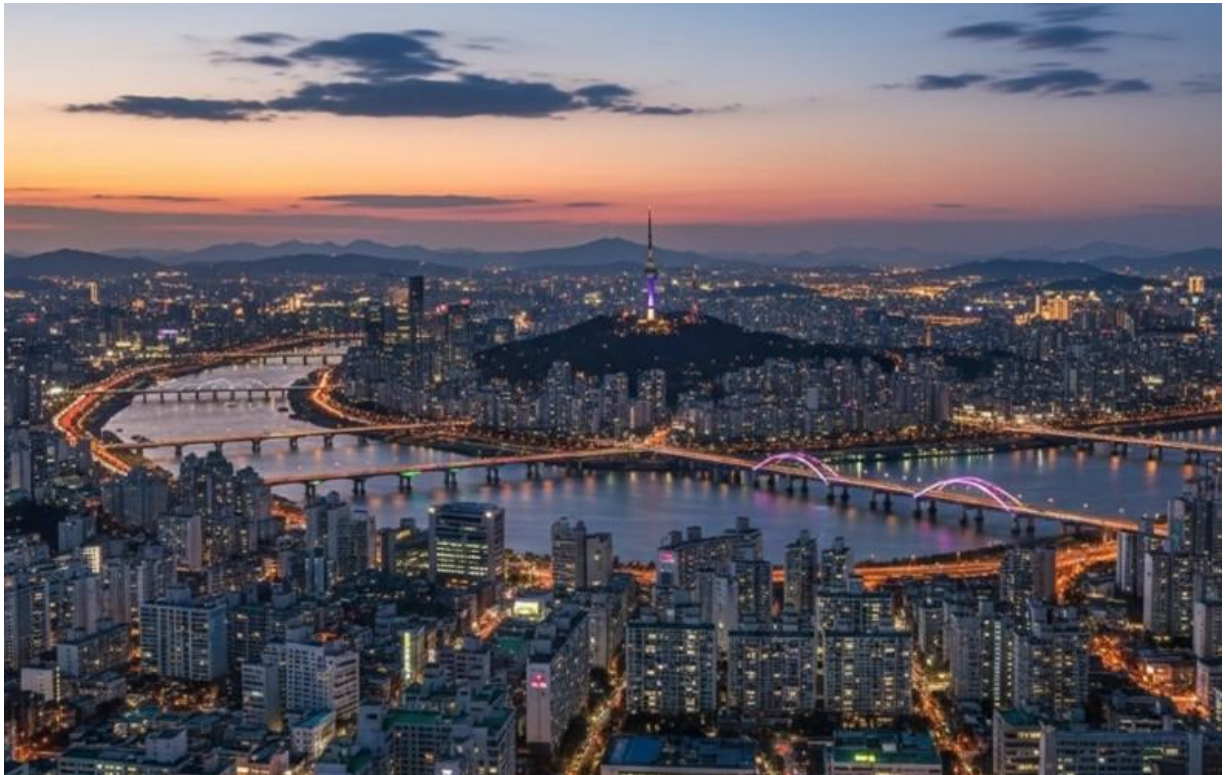
Downtown, Seoul, South Korea

Abstract Submission Due Date Extended to March 13, 2026 . (Refer to Page 5)