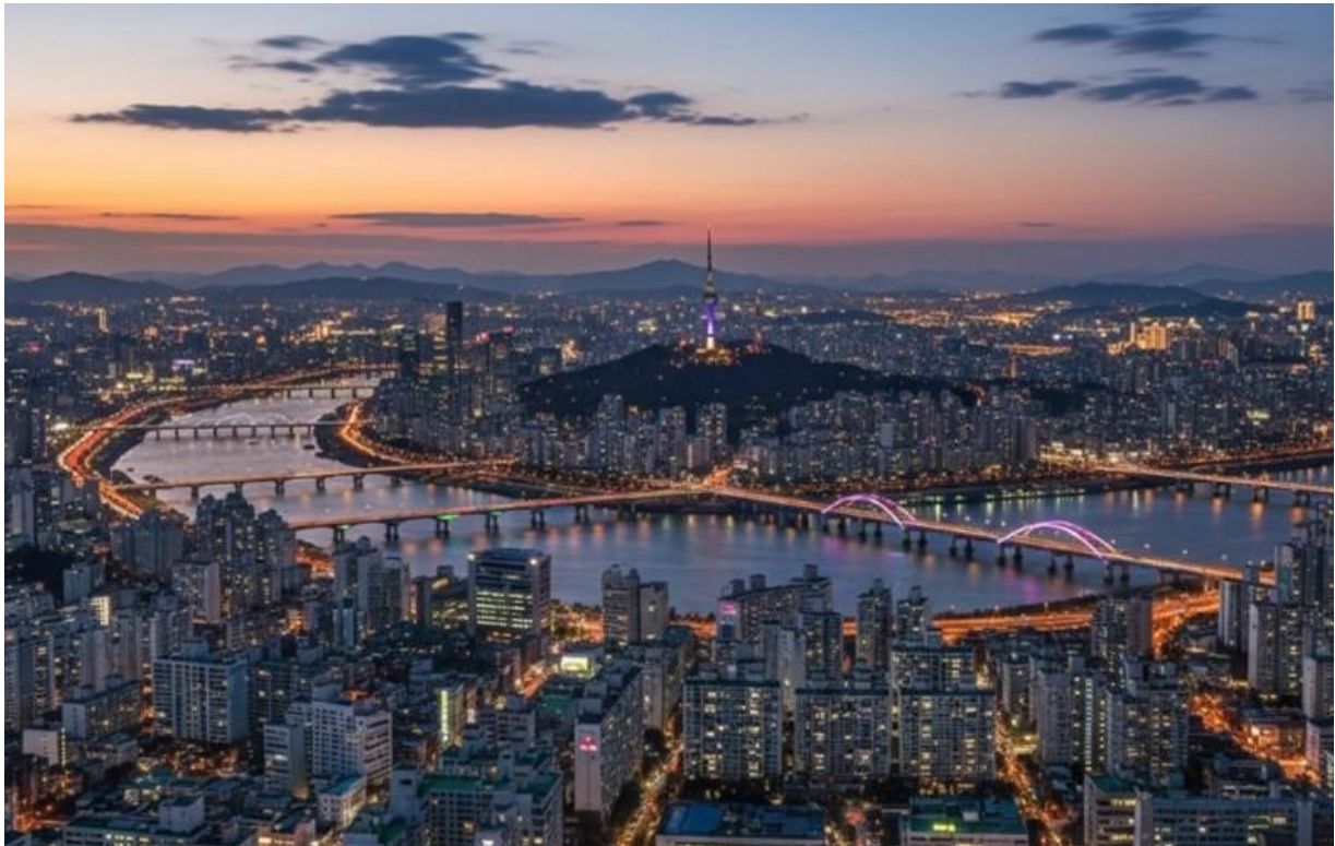
Downtown, Seoul, South Korea

The Ambassador Seoul - A Pullman Hotel, Seoul, South Korea May 19–22, 2026