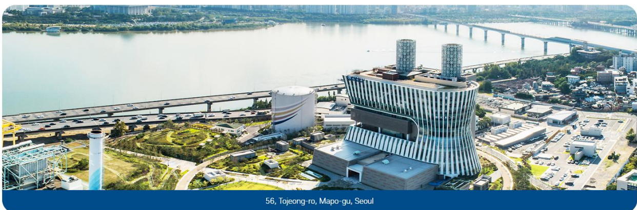
56, Tojeong-ro, Mapo-gu, Seoul

Seoul P.G. Site Div. has been a solid foundation for the energy industry of Korea, setting milestones for 100 years in the history of Korea's power generation. Now, Seoul P.G. Site Div. is preparing another 100 years ahead. It has used different fuels according to the transition of the age, applied new technologies in the energy industry, and spread technical skills to power plants throughout the nation. By making an underground thermal power plant, Seoul P.G. Site Div. suggested a new, future-oriented model of power plant in the energy industry, which will mark the beginning of a new history of the power generation industry in Korea.