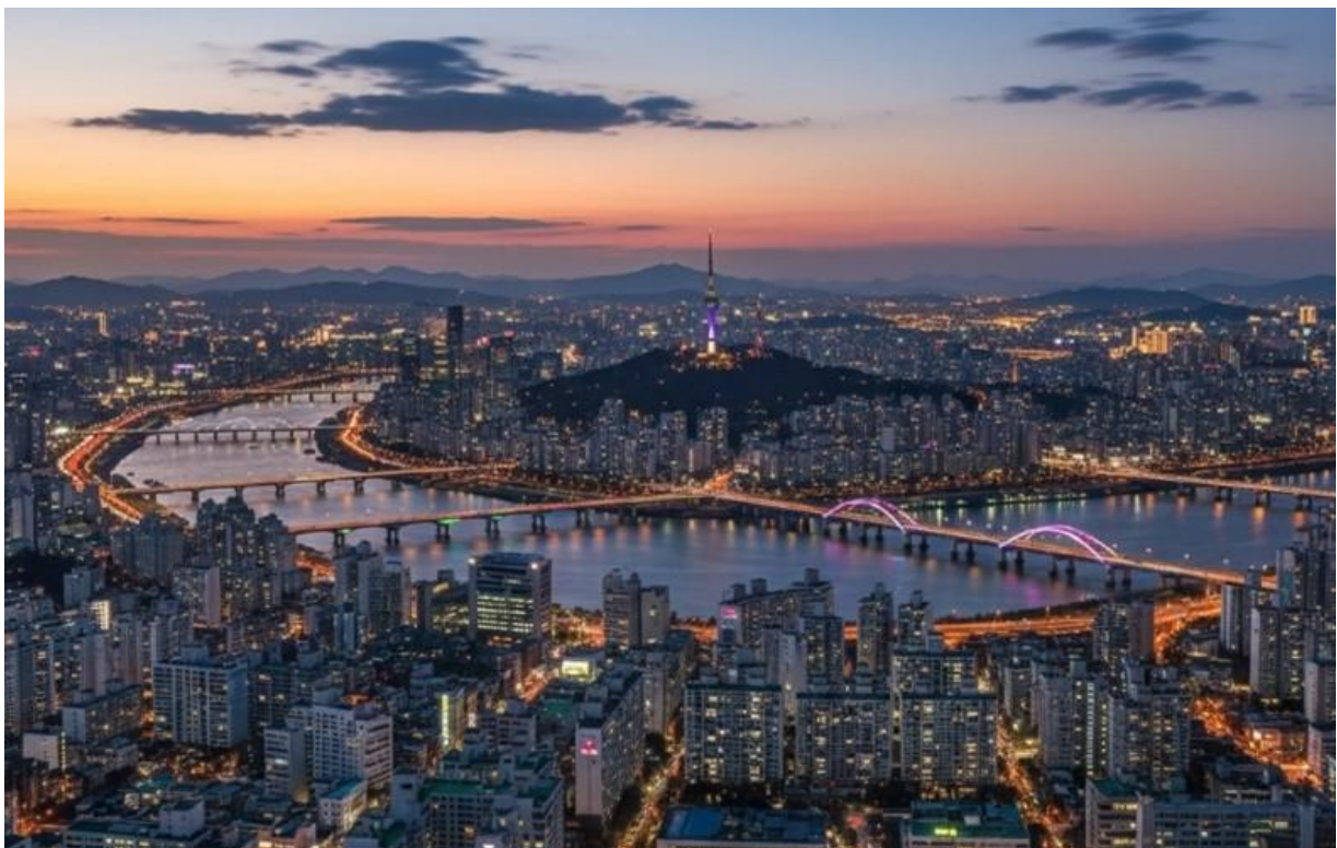
Downtown, Seoul, South Korea

In-Person Event ( Partially Online Streaming )