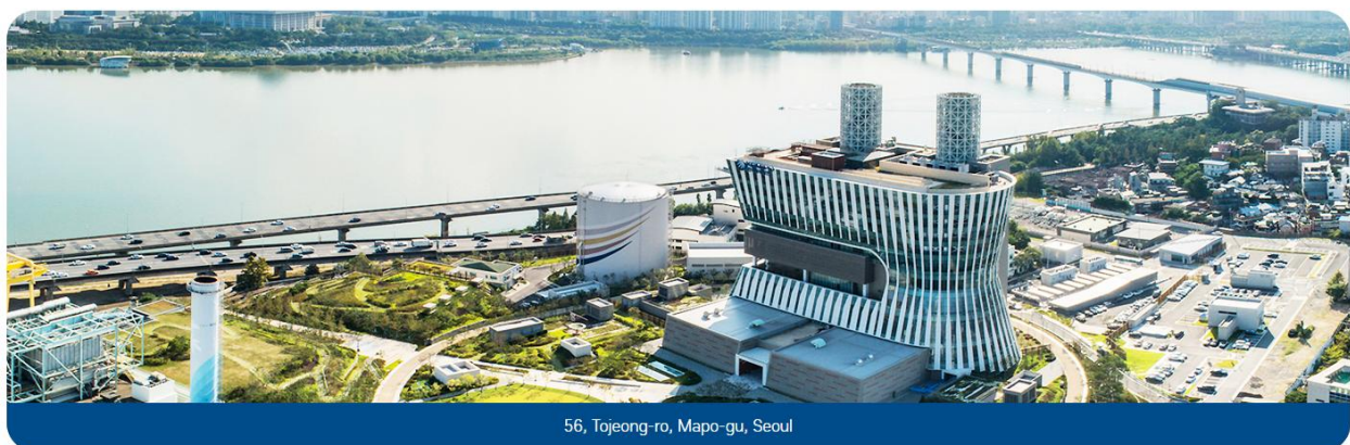
56, Tojeong-ro, Mapo-gu, Seoul

Seoul P.G. Site Div. has been a solid foundation for the energy industry of Korea, setting milestones for 100 years in the history of Korea's power generation. Now, Seoul P.G. Site Div. is preparing another 100 years ahead. It has used different fuels according to the transition of the age, applied new technologies in the energy industry, and spread technical skills to power plants throughout the nation. By making an underground thermal power plant, Seoul P.G. Site Div. suggested a new, future-oriented model of power plant in the energy industry, which will mark the beginning of a new history of the power generation industry in Korea.