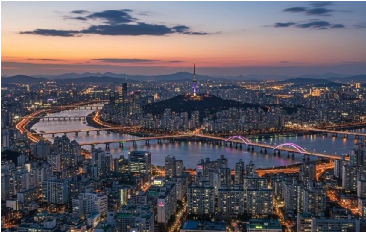
Downtown, Seoul, South Korea

In-Person Event (Partially Online Streaming)