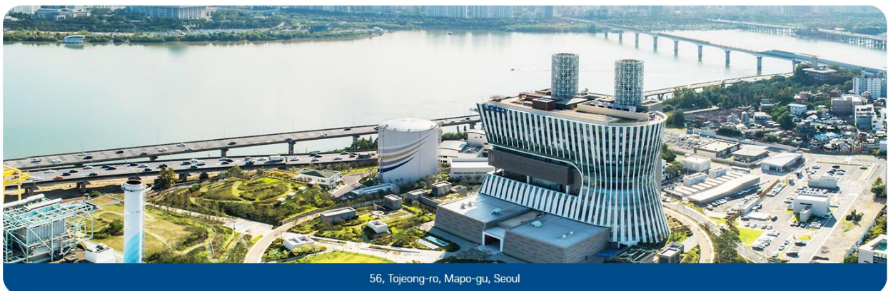
56, Tojeong-ro, Mapo-gu, Seoul

Seoul P.G. Site Div. has been a solid foundation for the energy industry of Korea, setting milestones for 100 years in the history of Korea's power generation. Now, Seoul P.G. Site Div. is preparing another 100 years ahead. It has used different fuels according to the transition of the age, applied new technologies in the energy industry, and spread technical skills to power plants throughout the nation. By making an underground thermal power plant, Seoul P.G. Site Div. suggested a new, future-oriented model of power plant in the energy industry, which will mark the beginning of a new history of the power generation industry in Korea.